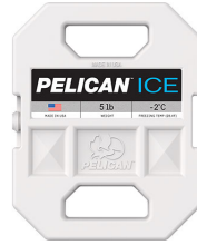
PI-5LB 5lb Ice Pack